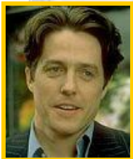
"Meet the Man With a Plan!"